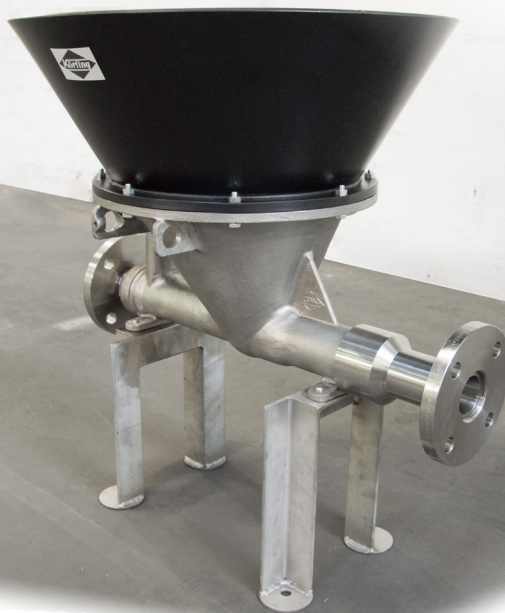
Stationary liquid jet solids ejector with flange connection

As an alternative to the hopper, a flange connection DN 150 is also available.