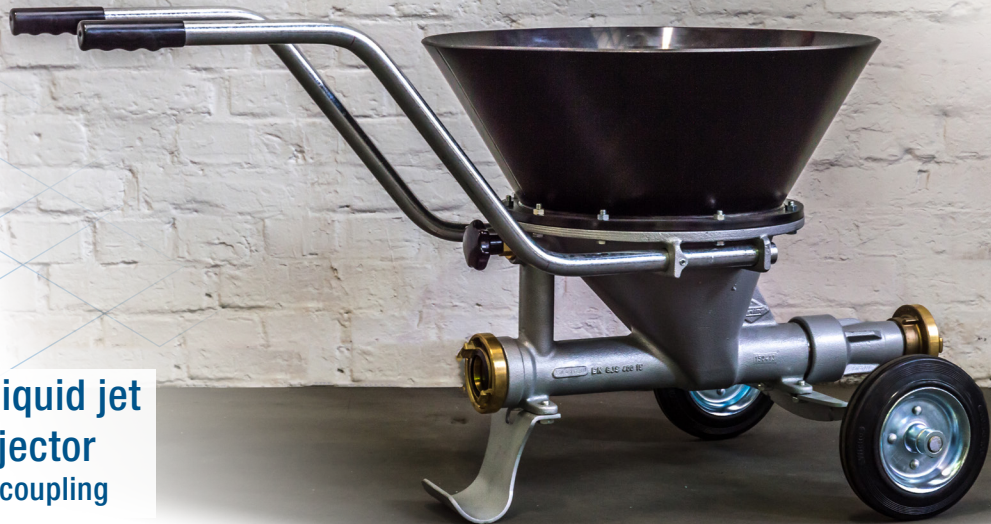
Mobile liquid jet solids ejector with hose coupling

Körting ejectors for conveying solids are available in nodular cast iron (GJS) or stainless steel (CrNi).