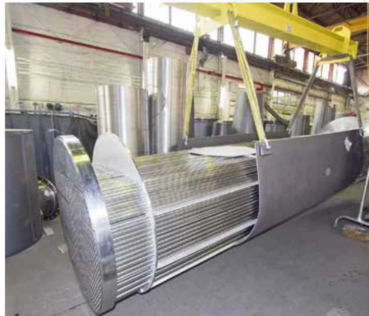
Assembly of a surface condenser destined for an oil refinery at the Körting plant in Hanover, Germany

The reasons for Körting's leadership in vacuum technology become particularly obvious when the total cost of ownership is compared. In addition to investment costs, this approach also identifies the costs of operating the plant (energy costs, repairs, maintenance) over several years. As a result, operators can see in terms of the total costs which investment is superior over a period of several years. As a result of these comparisons, many plant operators have opted for Körting Hannover AG's vacuum solutions.