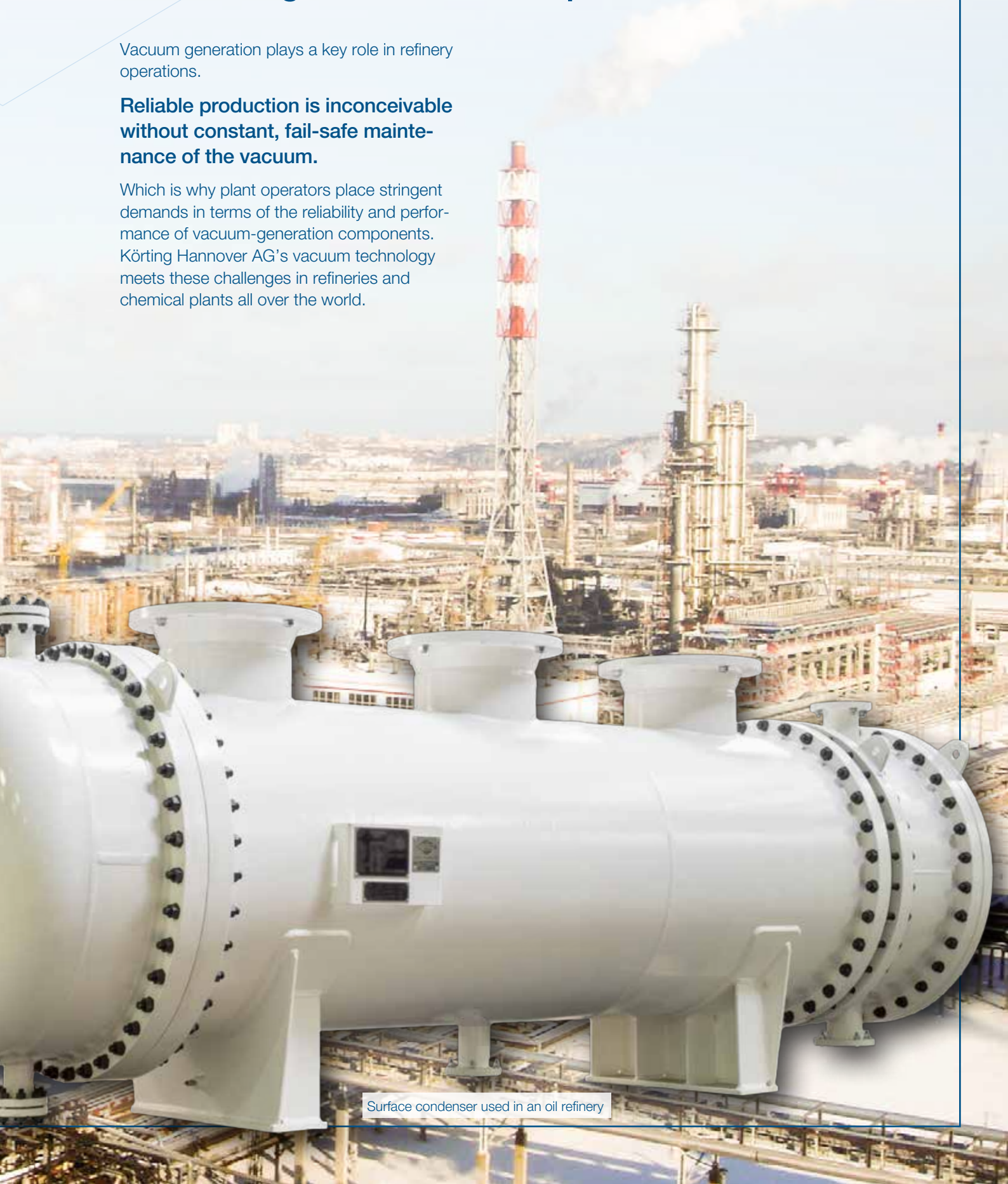
Surface condenser used in an oil refinery

Which is why plant operators place stringent demands in terms of the reliability and performance of vacuum-generation components. Körting Hannover AG's vacuum technology meets these challenges in refineries and chemical plants all over the world.