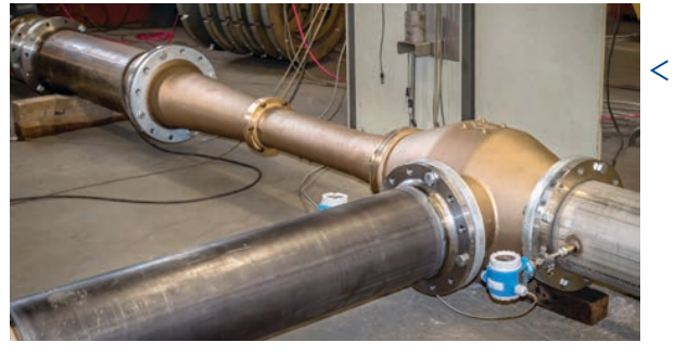
Test rig for GL certification of DN 300 nominal widths

and highly professional approach", says Kampers. Körting has already received enquiries about products in nominal widths of DN 300 for future projects.