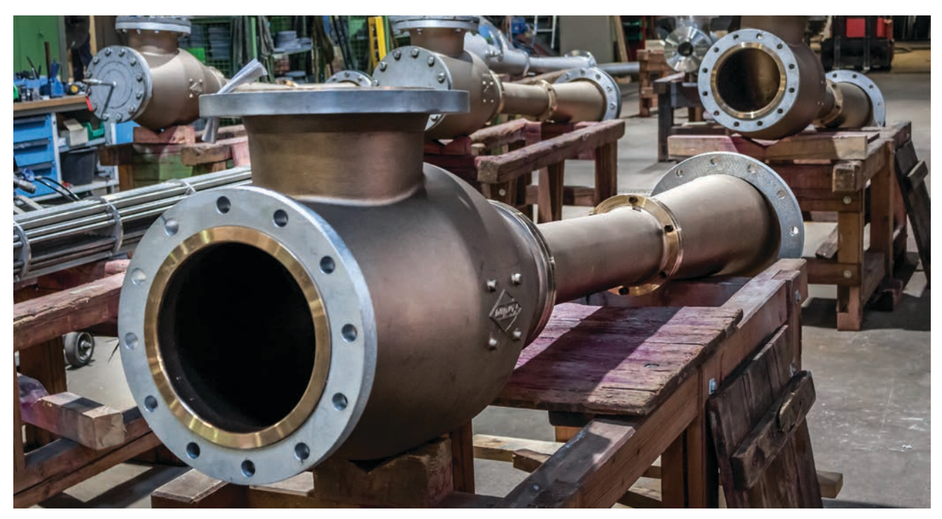
Custom-designed jet ejectors are produced and tested in the main plant in Hanover, Germany