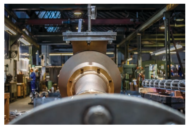
Jet ejector with suction power of more than 500 cubic metres per hour

With more than 140 years' experience in jet ejector technology, Körting Hannover AG can offer highly efficient and proven solutions for the shipbuilding industry. The current project for the Chinese COSCO Dalian shipyard shows just how customised these solutions can be.